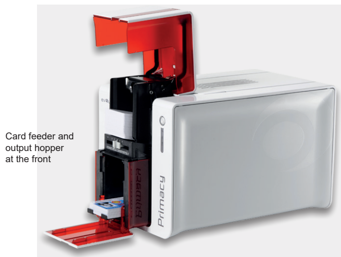
Card feeder and output hopper at the front