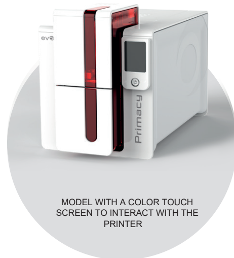
MODEL WITH A COLOR TOUCH SCREEN TO INTERACT WITH THE PRINTER